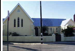
St Mark, Cambridge