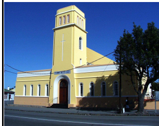
St Saviour East London