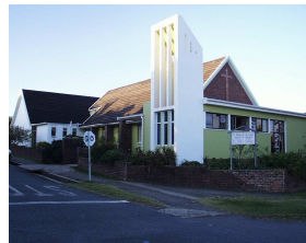
St Michael, Nahoon