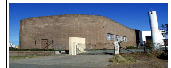
Good Shepherd Church