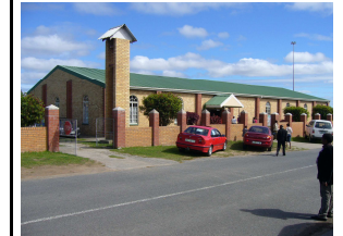
St Philip, Gompo